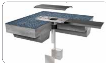
Transition Fittings – Utilizes abandoned poke-thru openings to bring cabling into the raceway. Available in 3" and 4" sizes.