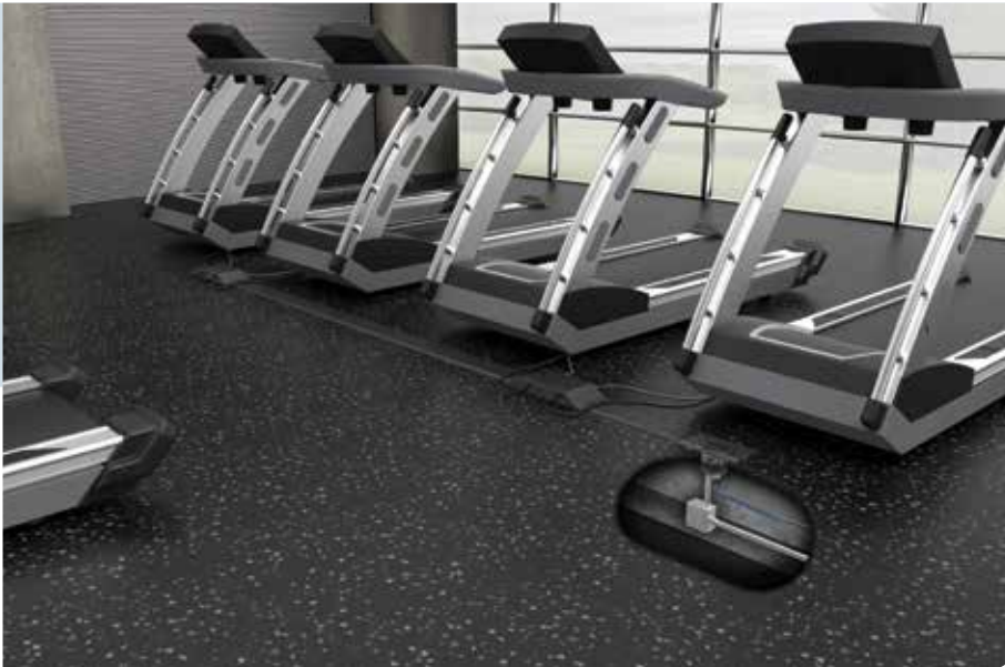
The OFR Series is perfect for offices or schools, conference rooms or fitness centers. Wherever access to floors and ceilings is not an option.