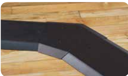
Flat Elbow – For making diagonal 45° turns on a single surface.