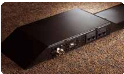
Open System – Accepts a wide range of communications and A/V devices from leading manufacturers.