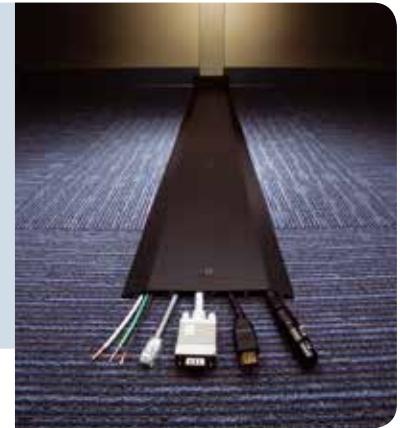
Multiple Channel Base – A single installation brings power, communications and A/V connectivity to open space locations in a durable, four-channel raceway.