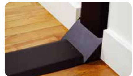
Inside Elbow – For internal right angle turns.