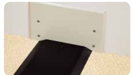
In-Wall Entrance End Fitting – Feeds the raceway from behind a wall. Configurable to provide one or two channels of power.