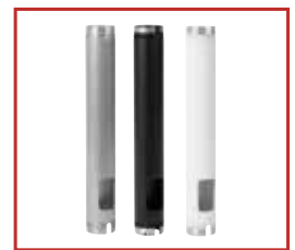
Available in silver, black or white to match displays, projectors and ceiling mount surfaces