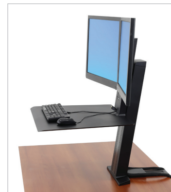
WorkFit-SR design prevents the keyboard tray from intruding into your space