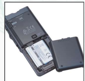
Rechargeable Lithium-ion battery

The DS-2700 offers advanced features such as stereo microphones for dictation and meeting recording, streamlining workflow and enhancing dictation management efficiency. The triple-layer studio-quality filter guarantees precise voice capture whilst minimizing unwanted sounds such as breath and wind vibrations. This results in superior accuracy, ultimately improving workflow efficiency.