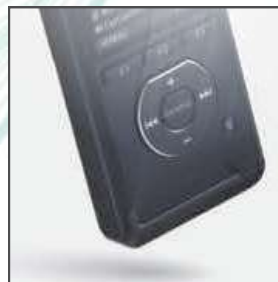
Resilient in everyday dictation