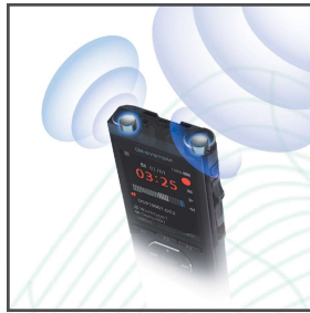
Stereo microphone system