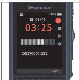
Full color screen