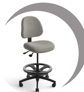
healthCentric Lab Stool FR