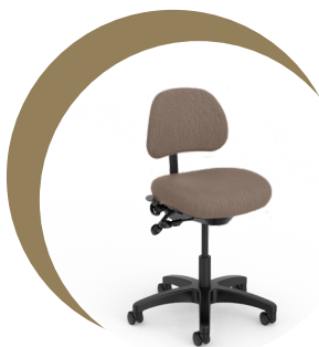
healthCentric Technician Stool

Actual upholstery may vary from the colors and images shown on your monitor. Please contact your local sales reps to order samples.