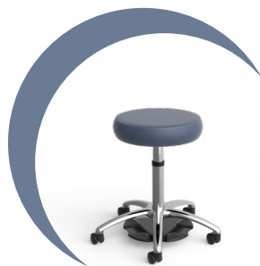
healthCentric Ultimate Medical Stool