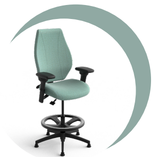
airCentric H2S Lab Stool